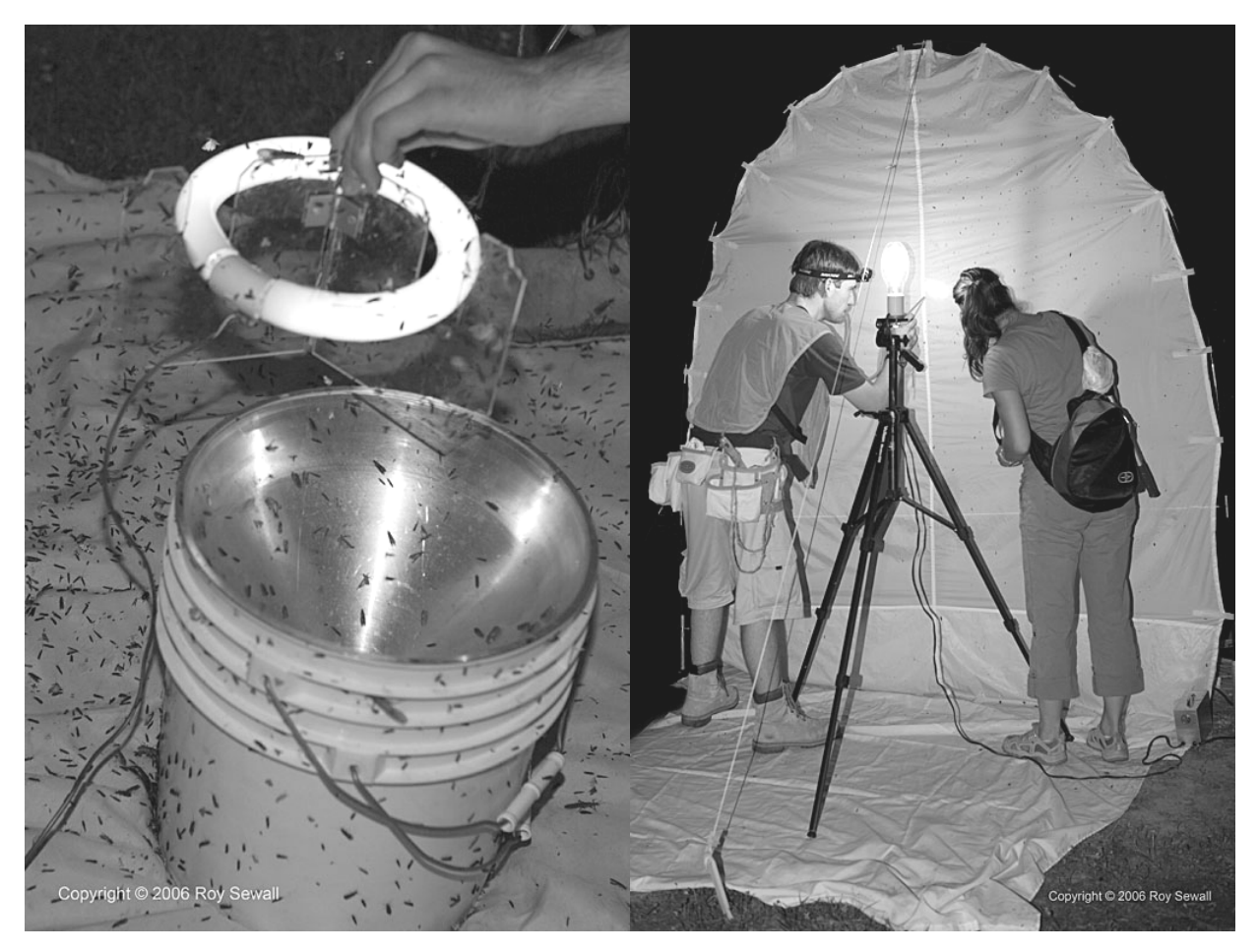
Fig. 5 (left). A 12-volt blacklight bucket trap for collecting nocturnal insects. ©2006, Roy Sewall. Fig. 6 (right). A 175-watt mercury vapor light set up for collecting nocturnal insects. ©2006, Roy Sewall.

Both diurnal and nocturnal inspections of various species of plants and their structures, including flowers, fruits, cones, branches, leaves, and needles were undertaken. Dead trees, logs, and stumps, especially those still covered with loose bark, and their associated