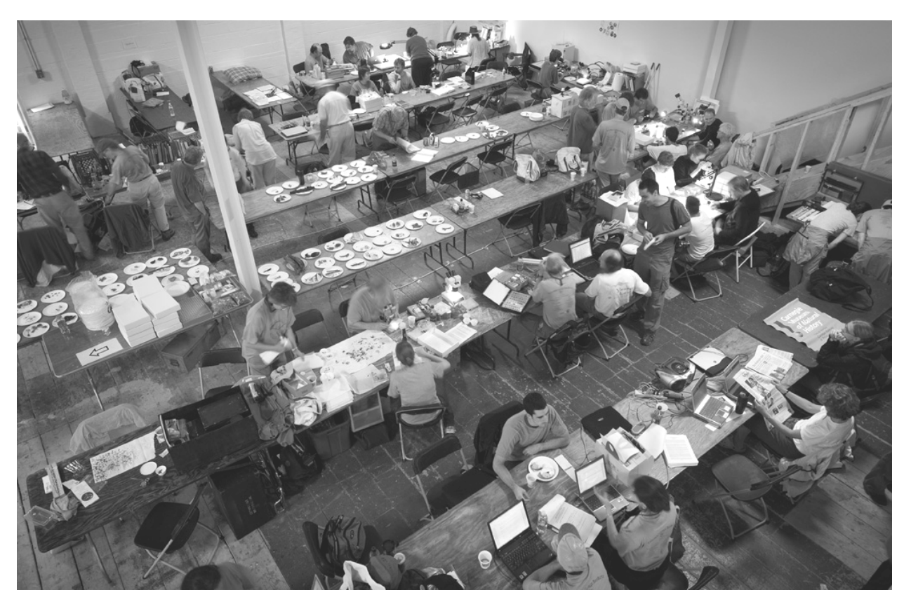
Fig. 1. Researchers and volunteers worked long hours to sort, prepare, and identify specimens at the base camp located at Glen Echo Park, MD.

and explaining the purpose of the BioBlitz. Since access to the base camp laboratory was restricted to BioBlitz volunteers, several field researchers took time out from their survey and identification work to spend time with the public, answering questions as they sorted specimens.