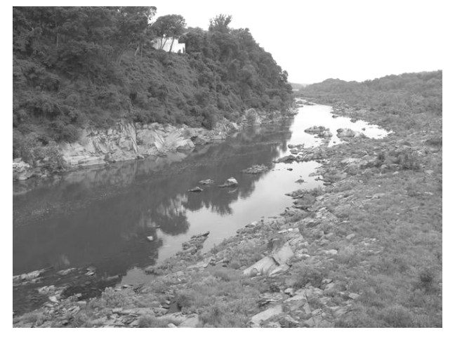
Fig. 4. Cast skins (exuviae) of dragonflies and damselflies were collected on rocks and vegetation along the shoreline of the Potomac River.