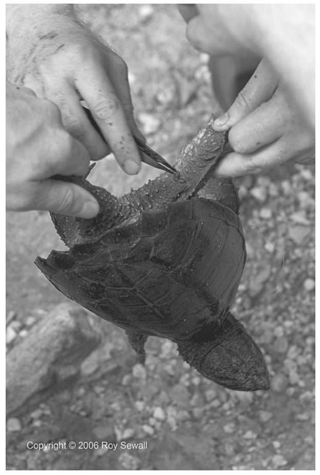
Fig. 10. Captured amphibians and reptiles were inspected for signs of disease or parasitic infection before their release.

3. A list of the resources (museum and university