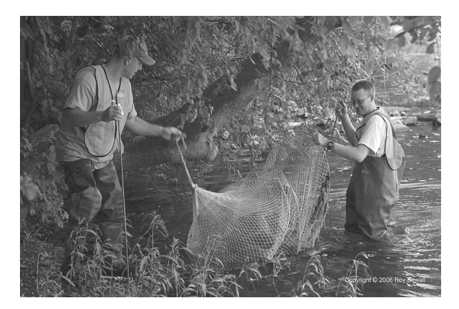
Fig. 9. Hoop turtle traps were deployed in Clay Pond and the Potomac River.