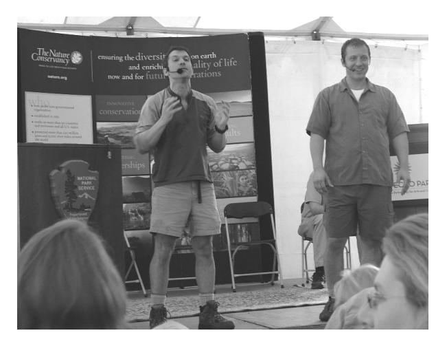
Fig. 2. Television's Kratt Brothers led the closing ceremony for the 2006 Potomac Gorge BioBlitz on a rainy afternoon at Glen Echo Park, MD.