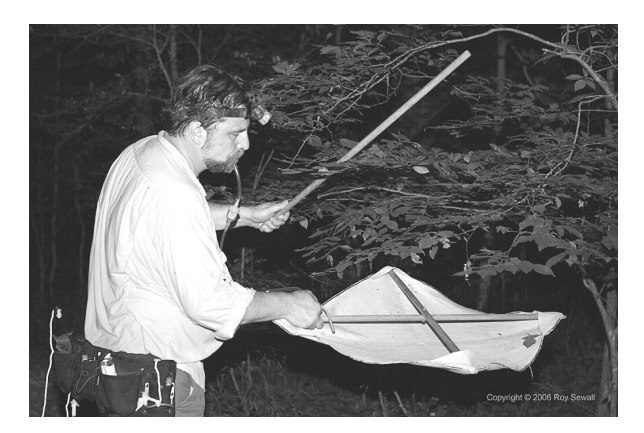
Fig. 7. Using a beating sheet at night with the aid of a headlamp to collect beetles.

fungi, were carefully inspected. Free-living fungi, mosses, and lichens were also examined with a hand lens to locate adult beetles.