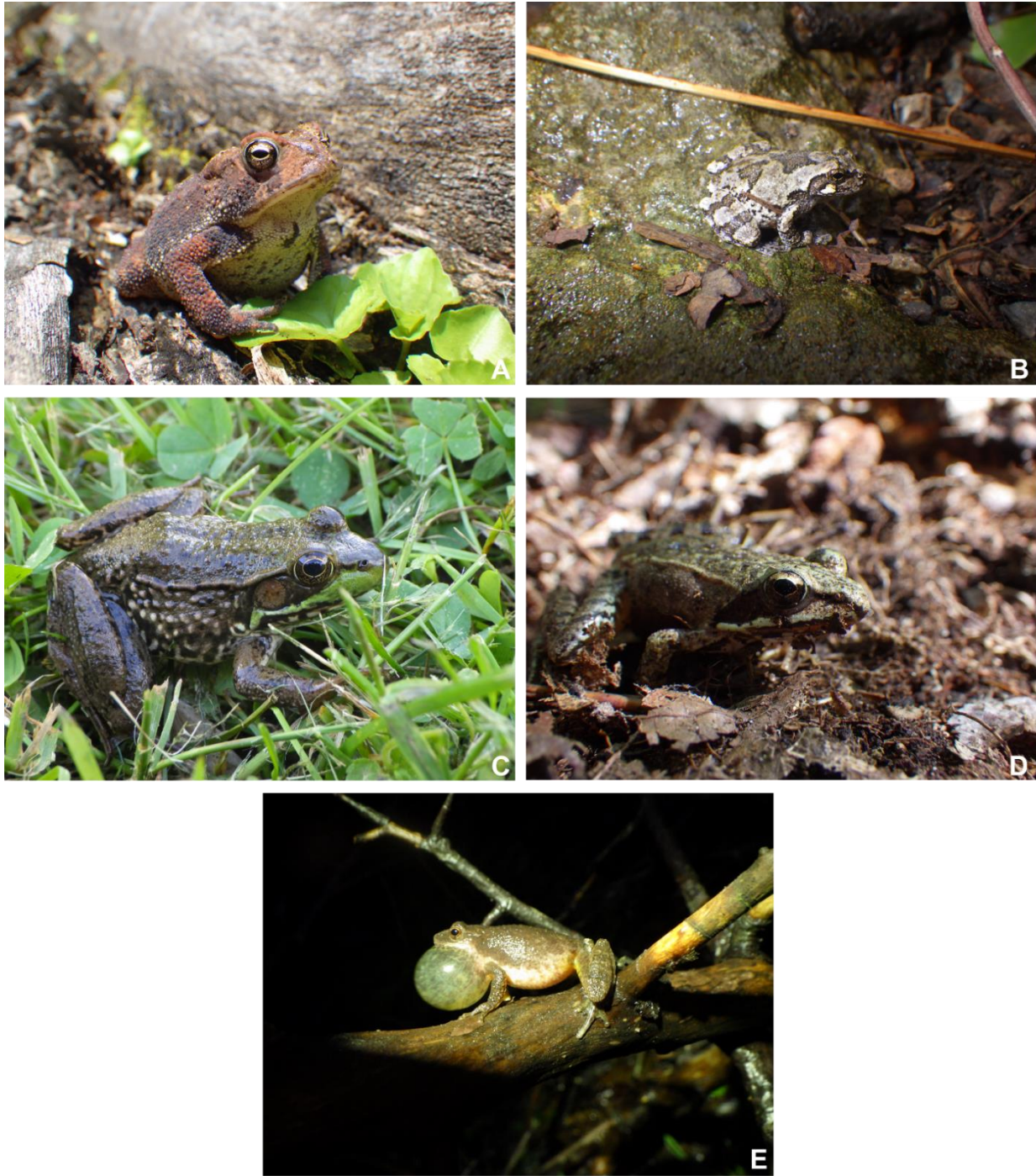
Figure 2. Frogs from Sweet's Farm. A: Anaxyrus americanus americanus (Eastern American Toad); B: Hyla versicolor (Gray Treefrog); C: Lithobates clamitans (Green Frog); D: Lithobates sylvaticus (Wood Frog); E: Pseudacris crucifer (Spring Peeper).

Spring Peeper ( Pseudacris crucifer [Wied-Neuwied, 1838]; Fig. 2E)