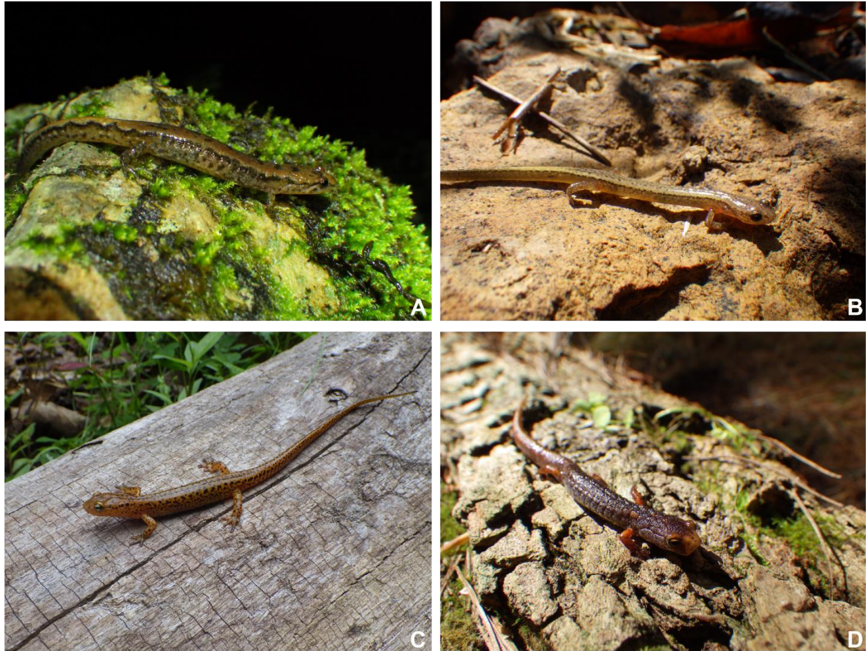
Figure 3. Salamanders encountered at Sweet’s Farm. A: Desmognathus fuscus (Northern Dusky Salamander); B: Eurycea bislineata (Northern Two-lined Salamander); C: Eurycea longicauda longicauda (Eastern Long-tailed Salamander); D: Hemidactylium scutatum (Four-toed Salamander).

Specimens: NCSM 105491; NCSM 105581; NCSM 105582