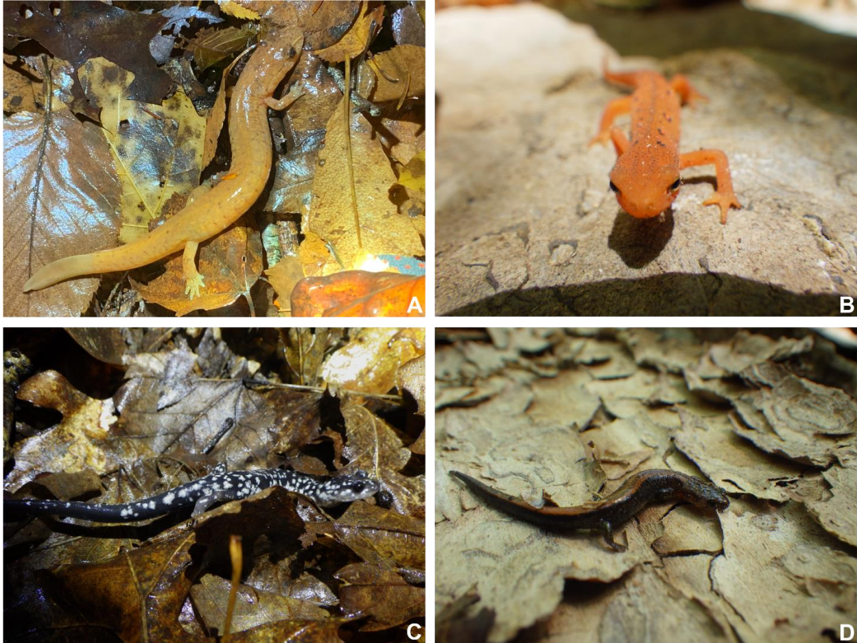
Figure 4. Salamanders encountered at Sweet's Farm. A: Gyrinophilus porphyriticus porphyriticus (Northern Spring Salamander); B: Notophthalmus viridescens viridescens (Red-spotted Newt); C: Plethodon cylindraceus (White-spotted Slimy Salamander). D: Plethodon cinereus (Eastern Red-backed Salamander). Image A courtesy of Isabella Bukovich.

Specimens: NCSM 105551; NCSM 105548; NCSM 105547; NCSM 105561