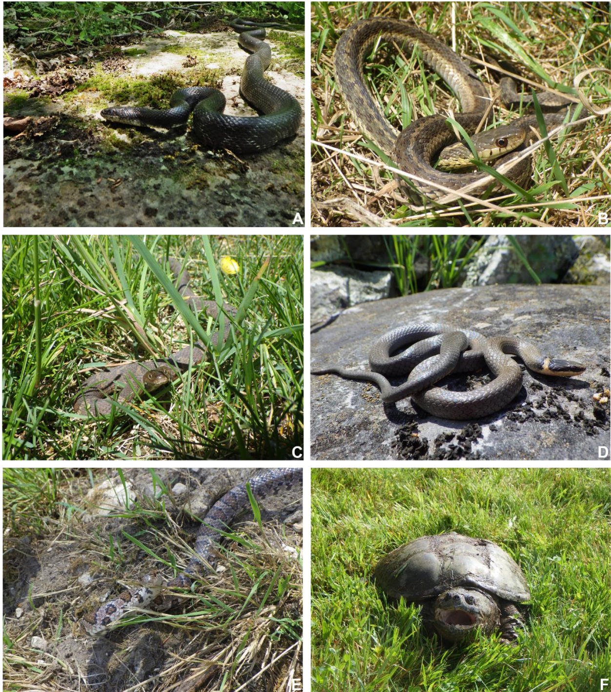
Figure 5. Reptiles encountered at Sweet's Farm. A: Pantherophis alleghaniensis (Eastern Ratsnake); B: Thamnophis sirtalis sirtalis (Eastern Gartersnake); C: Nerodia sipedon sipedon (Northern Watersnake); D: Diadophis punctatus edwardsii (Northern Ring-necked Snake); E: Lampropeltis triangulum (Eastern Milksnake); F: Chelydra serpentina (Snapping Turtle).

surveys, it warrants further exploration to determine whether the species still occurs on the property.