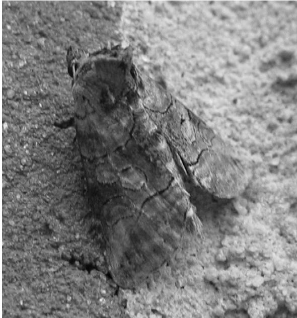
Fig. 2. Abrostola urentis photographed in Turkey Run Park, Fairfax County, Virginia, on 26 July 2004.

Maryland, dated 30 April and 24 July (no year given). The larvae of this species are reported to feed on Stinging Nettle ( Urtica dioica L., Urticaceae) and possibly on other species of Urticaceae as well (Lafontaine & Poole, 1991). Urtica dioica is found in Turkey Run Park but is also known in 30 other Virginia counties (Harvill et al., 1992). Other taxa in the Urticaceae that occur in Turkey Run Park are Boehmeria cylindrica (L.) Swartz. (False Nettle), Laportea canadensis (L.) Wedd. (Wood-Nettle), and Pilea pumila (L.) A Gray (Clear Weed), all of which are more common statewide than U. dioica (Harvill et al., 1992). Thus, the apparent rarity of Abrostola urentis in Virginia is unlikely related to the rarity of its host plant.