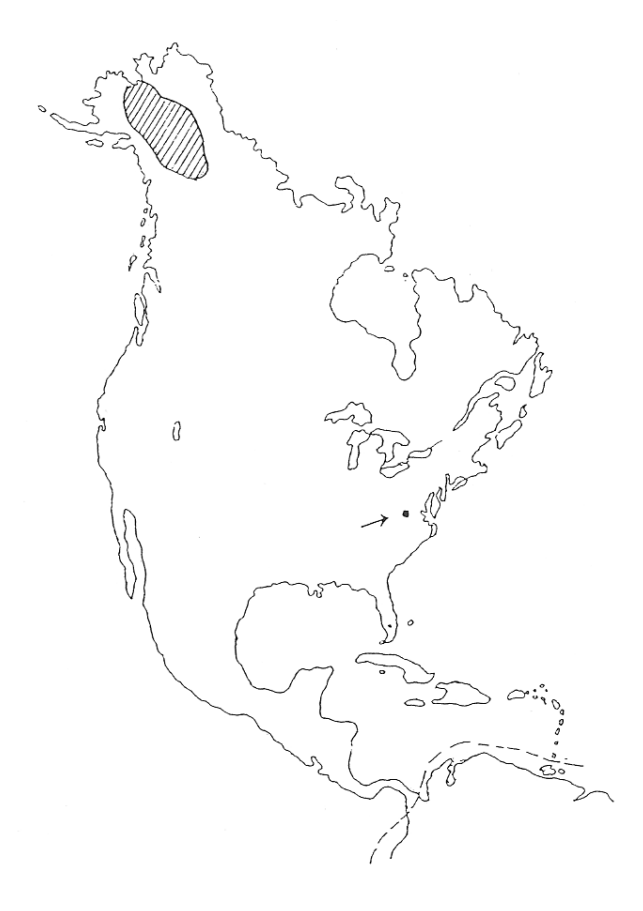
Fig. 2. Outline map of North America, showing primary range of Escaryus ethopus in Canada and Alaska (shaded), and location of site in the Virginia Blue Ridge (arrow).

Heretofore this species has been recorded only from Alaska and Yukon Territory, Canada (Pereira & Hoffman, 1993, Map 1). Although widely disjunct distributions between the Appalachians and western North America have long been known, they have been almost invariably at the generic level. The present case involves a separation of more than 2600 mi/4160 km and displacement far to the south from the subarctic primary area (Fig. 2). Fragmentation of a once continuous North American range may be invoked as the only plausible explanation; the existence of other small disjunct populations may be reasonably assumed.