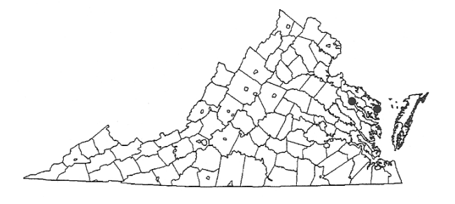
Fig. 2. Field sites visited on 8 March 2000.

Although P. australis is widespread in the coastal areas of Virginia, there have been no records of herbivores associated with this plant from the state. In this paper we report the discovery of four introduced European species in Virginia, known to be specialized on P. australis , at two field sites, 49 km (30 mi) apart (Fig. 2). Both sites were visited on 8 March 2000 and surveyed for insect herbivores.