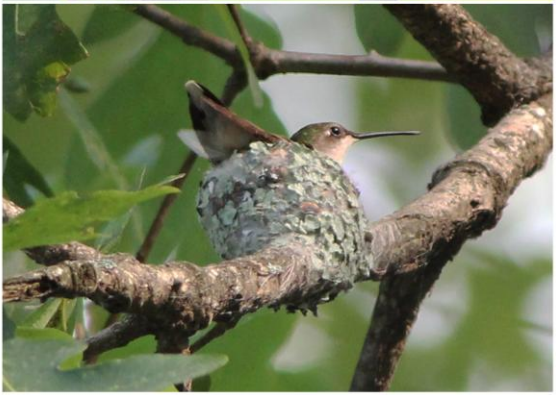
Fig.1. Variation in orientation of an incubating female Ruby-throated Hummingbird ( Archilochus colubris ).