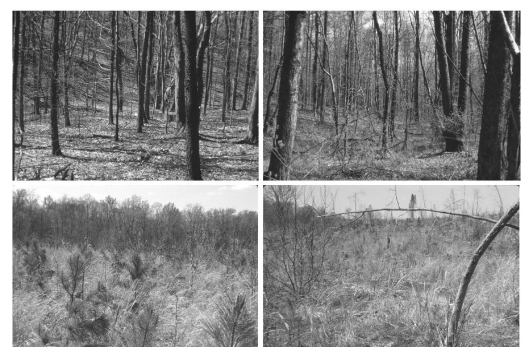
Fig. 2. Photographs of the four sampling sites in Cumberland County. Upper left: HW-N, upper right: HW-S, lower left: OF-N, lower right: OF-S. See text for site descriptions.