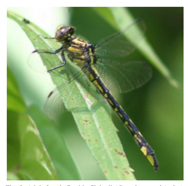
Fig. 2. Adult female Rapids Clubtail ( Gomphus quadricolor ) from the Moormans River, Albemarle, County, Virginia.

From mid-April through May, Ashy Clubtails are common both in vegetation near farm ponds and slow