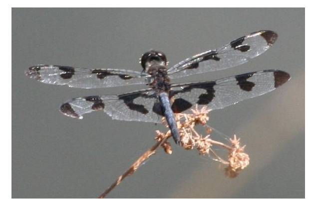
Fig. 3. Adult male Banded Pennant ( Celithemis fasciata ) from the Childress/Payne pond, Albemarle, County, Virginia.

This pennant is somewhat uncommon in Albemarle County, but can be found at ponds, usually sitting