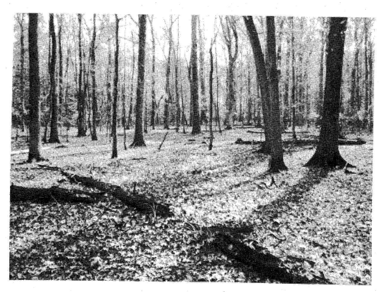
Figure 1. Forested wetland swale in the northwestern corner of NSWCDL, King George County, Virginia. Photograph by K. A. Buhlmann, 6 November 1991.

and lies entirely within the northern Coastal Plain physiographic region. NSWCDL has been operated by the U.S. Department of the Naw since 1919. The facility covers approximately 1758 ha (T. Wray, personal communication). It is bordered by the Potomac River on the east. Narrow coastal beach scrub habitat exists along the Potomac River. Upper Machodoc Creek divides NSWCDL into two sections. The northern portion (Mainside) is bordered by U.S. Rt. 301 on the north and the town of Dahleren on the west. Mainside is further divided by north-south flowing Gambo Creek. The southern portion is called Tetotum Flats and includes a wetland known as Black Marsh. Gambo Creek and Black Marsh are extensive freshwater/brackish tidal marsh systems. Forested habitat provides buffers for much of the these aquatic systems. Natural terrestrial vegetation throughout the area includes loblolly pine (Pinus taeda) and oak-dominated hardwood forests.