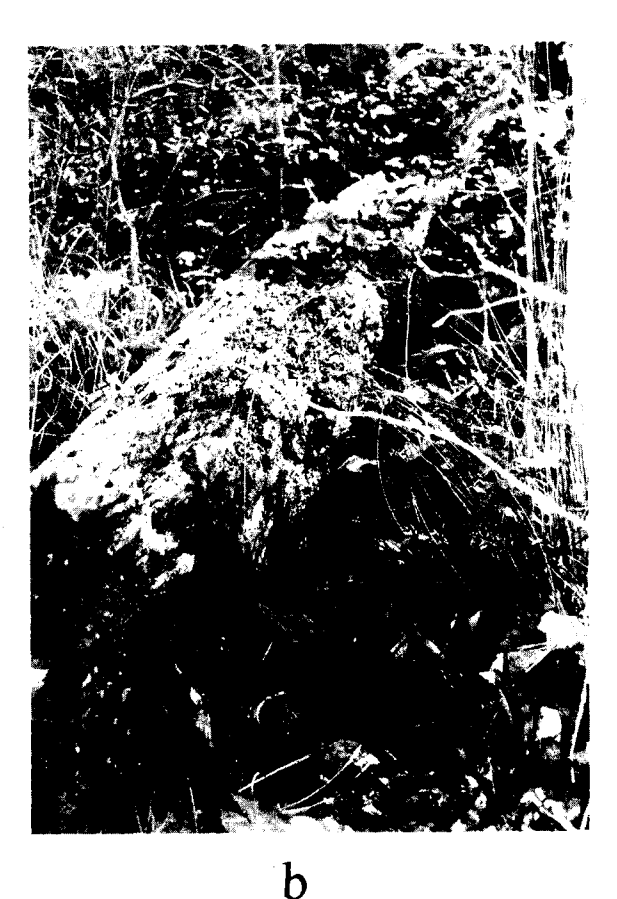
Fig. 1a,b. a, drift fence and 3.8-1 pitfall trap array design used to capture small terrestrial vertebrates in southeastern Virginia. b, installed, isolated 0.47-1 aluminum can pitfall trap used to capture small terrestrial vertebrates.

composition. Habitats and site locations are described briefly in Erdle & Pagels (1995) and in Table 1. In 13 of the sites (labeled S), a single 5-6 m drift fence made of 30 cm-tall black silt fencing (Enge, 1997) and a pair of 3.8-1 (#10 can) pitfall traps were installed in the ground (Fig. 1a). Can openings were sunk flush to the surface of the ground on each side of the ends of the fence. At site S3, two 7.6-l (2 gallon) plastic buckets and 12 single 0.47-l (16 oz) aluminum cans were placed in a variety of locations near the pitfall array. Pitfalls associated with drift fences were shielded with a section of silt fencing constructed to reduce flooding from rainfall (Fig. 1a). In 9 of these sites, four to seven 0.47-1 aluminum cans were sunk in selected locations around the area. Number of trap nights ranged from 660 to 2160 for drift fence/pitfall trap arrays and 388 to 3480 for isolated pitfall traps. In another 12 sites (labeled C), 5-11 isolated 3.8-1 or 0.47-1 aluminum can pitfalls were installed randomly in the substrate (Table 1). Many of the isolated cans were placed adjacent to logs and other surface objects