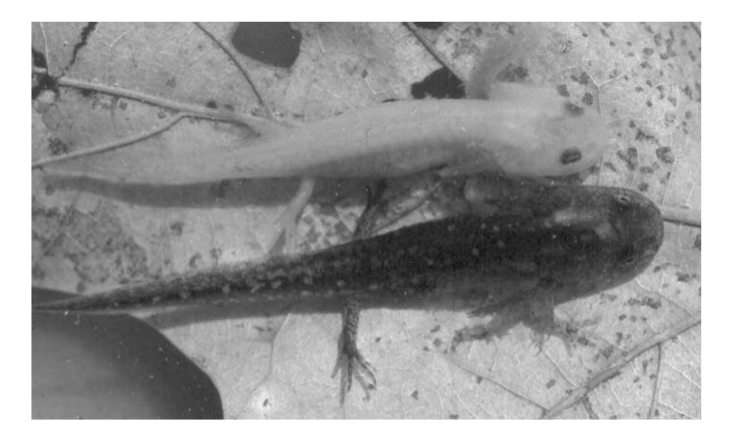
Fig. 1. Leucistic and normal Ambystoma opacum larvae from Fort A.P. Hill, Caroline County, Virginia.