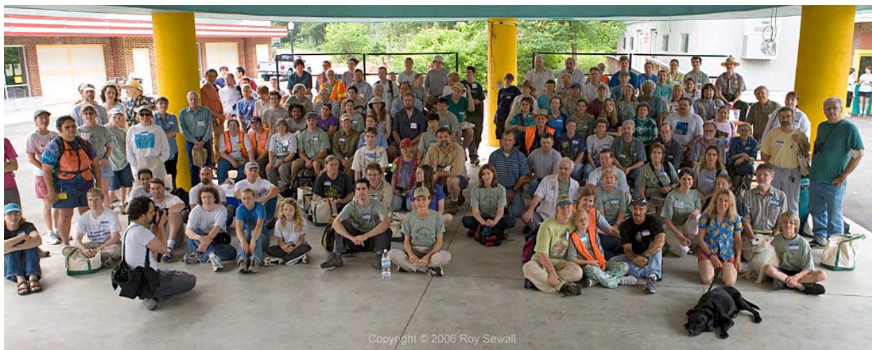
One hundred forty scientists, naturalists, students, and volunteers participated in the 2006 Potomac Gorge BioBlitz.