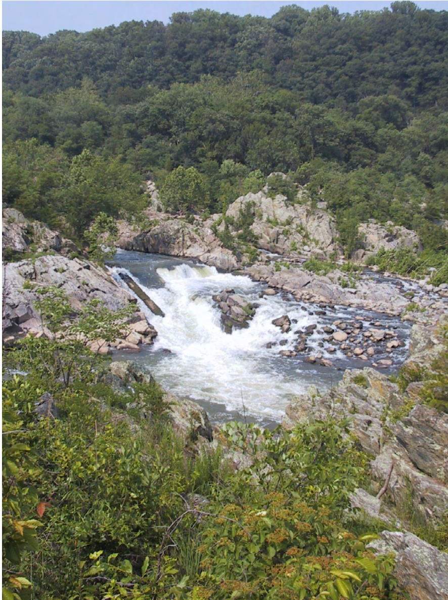
Potomac River Gorge

A JOURNAL DEVOTED TO THE NATURAL HISTORY OF VIRGINIA