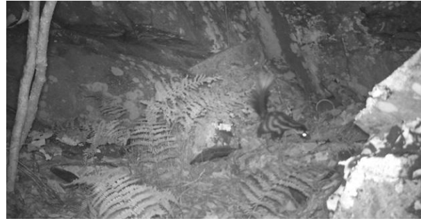
Fig. 2. Eastern Spotted Skunk ( Spilogale putorius ) in rock outcrop on Hightop Mountain on 25 September 2015 in the southern district of Shenandoah National Park, Greene County, Virginia.

Of the seven sites where we detected Eastern Spotted Skunks, two (Madison and Greene counties) were located on talus slopes with little to no canopy cover. Although this species is known to inhabit rock outcrops (Diggins et al., 2015), they are believed to avoid areas with an open canopy to avoid predation by Great Horned Owls ( Bubo virginianus ) (Lesmeister et al., 2009). Our use of a scent-lure might explain why these individuals were detected on talus slopes. Our capture success was comparable to that reported by Hackett et al. (2007) using live traps, but lower than