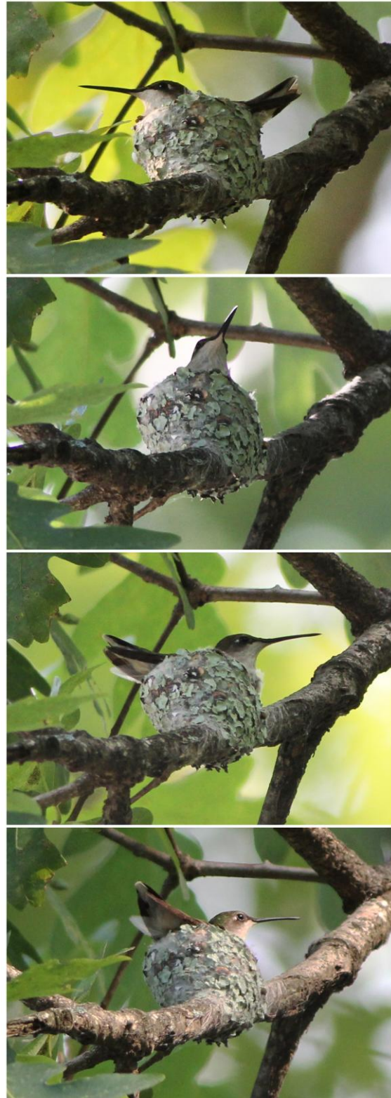
Fig.1. Variation in orientation of an incubating female Ruby-throated Hummingbird ( Archilochus colubris ).

Incubation sessions were punctuated by brief feeding forays. The returning female invariably approached the nest from the same direction after a series of short hovering flights before settling immediately in the nest cup. However, I noted that the compass direction of the incubating female seemed to shift randomly, or nearly so, in successive incubation bouts (Fig. 1). Photographs taken from the same vantage point revealed that the elastic walls of the nest flexed in the direction faced by the incubating female.