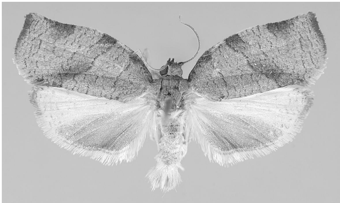
Choristoneura rosaceana (Harris), the obliquebanded leafroller.