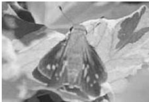
Fig. 2. Brazilian Skipper ( Calpodus ethlius ) photographed by Fletcher Smith at Eastern Shore of Virginia National Wildlife Refuge on 1 December 2001.

3 N = Northampton County record; D = Delmarva Peninsula record; C&C = species reported from Northampton County by Clark & Clark (1951); common statewide species were often reported as such, without county by county lists.