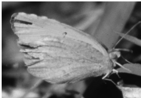
Fig. 3. Sleepy Orange ( Eurema nicippe ) photographed by Calvin Brennan at Eastern Shore of Virginia National Wildlife Refuge on 1 April 2001.