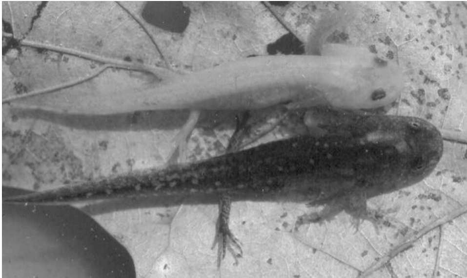
Fig. 1. Leucistic and normal Ambystoma opacum larvae from Fort A.P. Hill, Caroline County, Virginia.